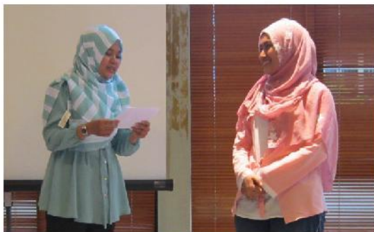
Table Topics Session, Jan 12th 2017